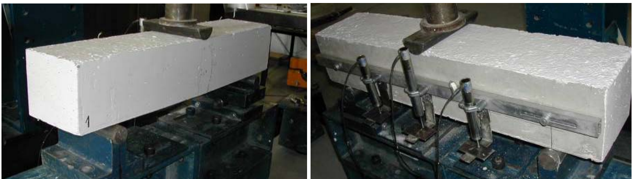
Figure 1: Three point loading tests in slab strips

For each composition three cylinders (150 mm diameter and 300 mm height), three cubes ( 150 \times 150 \times 150 mm 3 ) and four prismatic specimens ( 600 \times 150 \times 150 mm 3 ) were casted and tested to evaluate the compression and bending behavior of the developed concrete compositions. To evaluate the influence of the fiber percentage in the shear resistance of HSC elements, three point loading tests (see Fig. 1) in slab strips ( 800 \times 170 \times 150 mm 3 ) were performed (distance between supports equal to 720 mm). For each composition, four slab strips were casted, two of them including ordinary longitudinal reinforcement ( 2\Phi 20 to assure shear failure) and two without ordinary reinforcement, to serve as reference. A total of twenty-four slab strips were casted and tested.