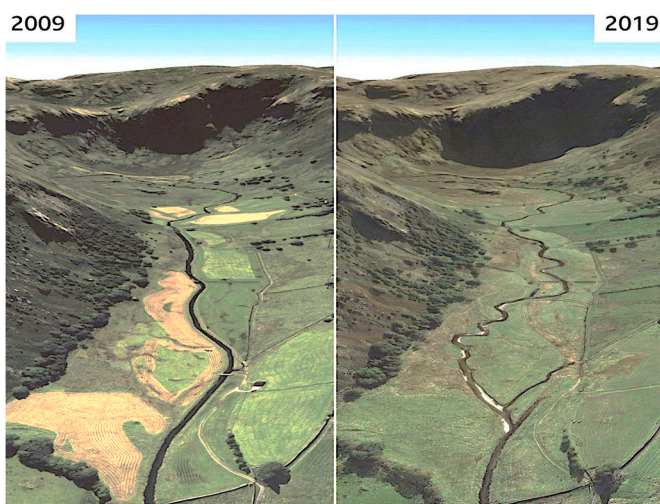
Fig. 3. The Swindale Beck, Cumbria England, before and after river restoration (after BBC).