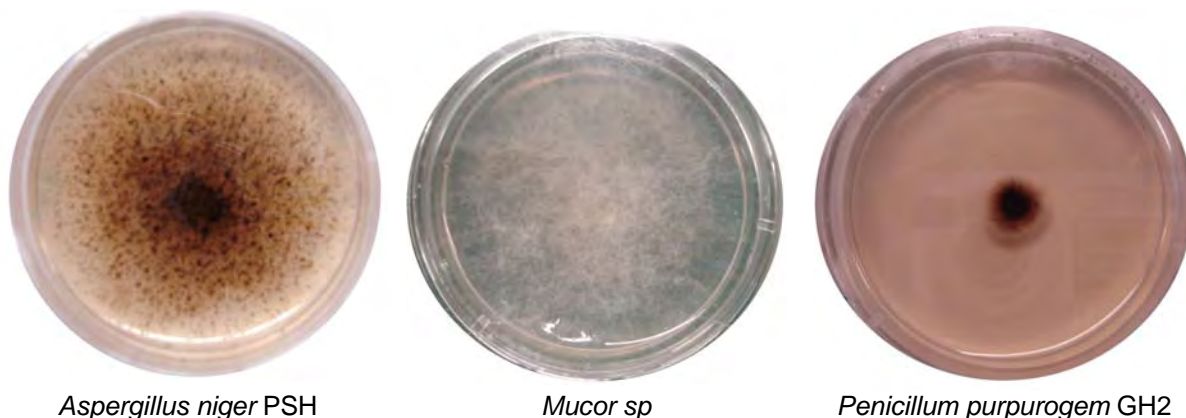
Figure 1. Microorganism with growth presence over fucoidan-urea dishes

Submerged fermentation experiments were realized comparing the strains that showed growing capacity over fucoidan. Urea was selected as the nitrogen source applied in the culture medium. The morphological form observed during the submerged culture where dispersed mycelial filaments. The particular form exhibited is determined not only by the genetic material of the fungal species but also by the nature of the inoculum as well as the chemical and physical culturing conditions (Papagianni, 2004).