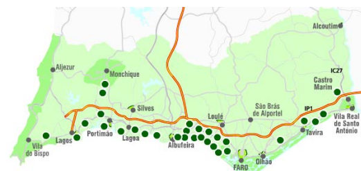
Figure 4: Map of the Algarve region showing golf courses

Tourism competes with agriculture and forestry as important activities, provoking a dead-end competition between land-uses (on going for over fifty years). The invasion of golf courses, Figure 4, in what branders/marketers place as Europe’s paradise for golf or beaches classified as Top 1 to Top 10 in the world (Dona Ana in Lagos, Rocha, in Portimao) has followed the typical coastal route, first between Lagos and Portimão, later on from Portimão to Faro, and finally the recent movement to the mountains, from Portimão to Monchique, where the addition of spa thermal springs “enhances” the entertainment package.