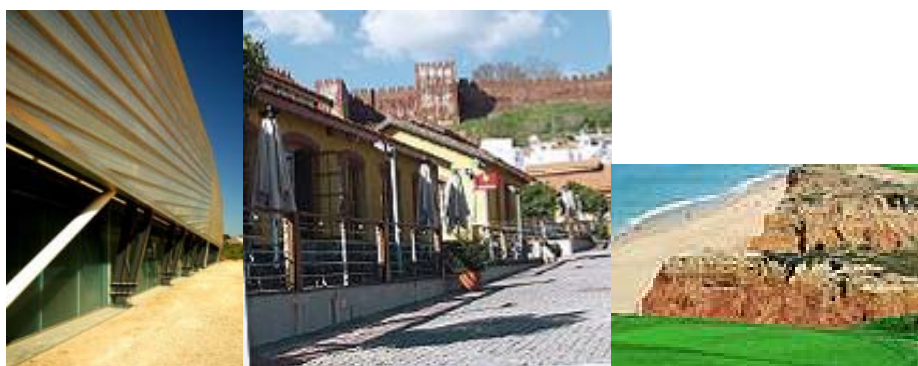
Figures 5a, 5b, 5c: The Portimão Arena, The Cork Museum, The Penina complex.

The Portimão Arena complex. This multi-function pavilion, opened in September 2006, is the biggest of its sort south of Lisbon. It occupies half an hectare and allows Congresses up to 5600 persons - hardly a European Congress number that normally average at most 500 delegates. It is a public-private partnership and it is innovative in the sense that it fully opens the Algarve for the MICE (Meetings, Incentives, Congresses and Events) segment. The river area where it is located has also other equipments as Exhibition and Fairs Halls and a parking that provides space for 1000 automobiles and 30 buses. A sports complex, including a football stadium, a complex of swimming pools and a sports pavilion, is also to be expected to open in 2010 and cost estimates are 180M dollars.