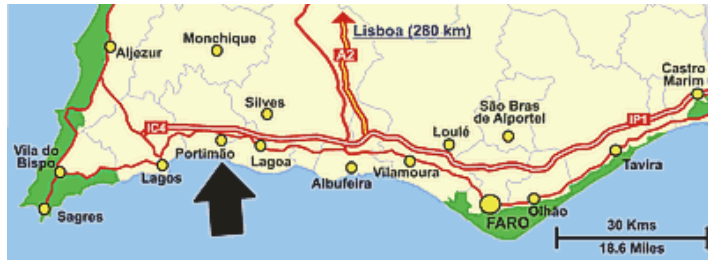
Figure 3: Map of the Algarve region

The three projects in Algarve are the The Penina Hotel and Golf/horse riding complex, the Cork Museum / Factory of the Englishman complex and the Morgado complex. The macro-spatial structure of Algarve is shown in Figure 3.