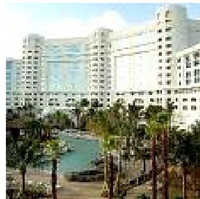
Figures 2a, 2b, 2c: Westin Diplomat, Art Park, Seminole Hard Rock