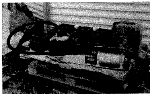
Fig. 1 - Vibrator and moulds.

Some companies were contacted, to collect in their sites concrete specimens, testing them in the Laboratory of Materials of Construction of the University of Minho. For the accomplishment of the tests existent equipments were used at the Laboratory (Fig. 1 and 2).