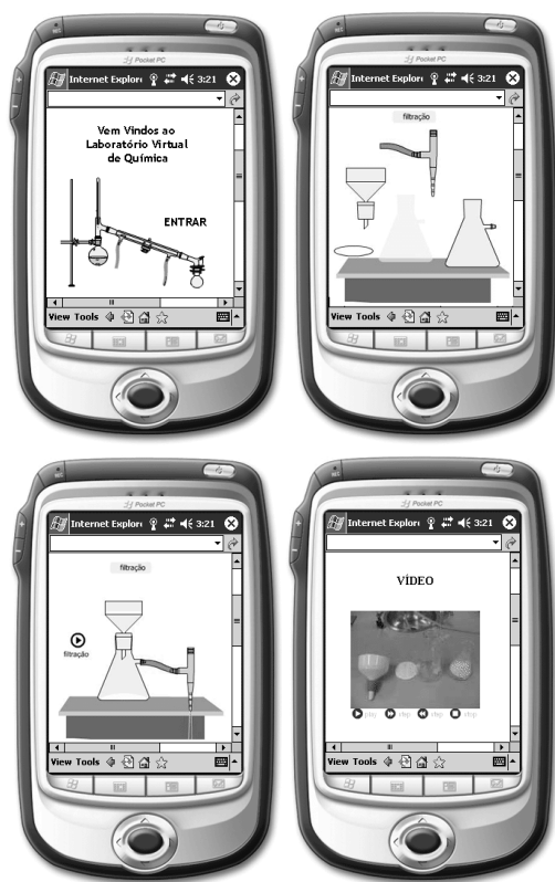
Picture 2. Phases of the experiences in the virtual laboratory

When teaching chemistry, whether in presence or in distance, two aspects have to be considered: the theoretical part, composed of the content, and the practical part, where all knowledge is applied through the experiences in laboratories. To perform some experiences, it is necessary to have time and money, which is beyond the possibilities of many institutions. To overcome the financial problems and to raise the access to practical experiences, studies are made to develop the virtual laboratories that can be a solution if applied in distance education through computer.