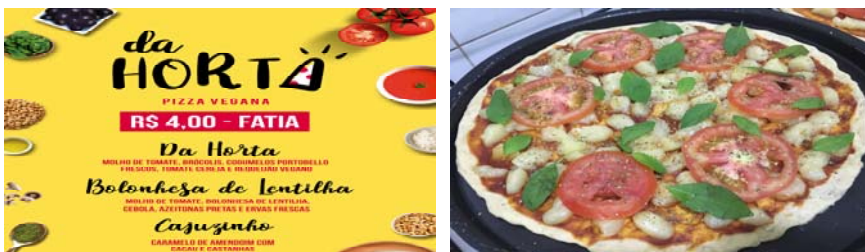
Figure 3 – Flipped Classroom evidences

The students made use of three types of infrastructure: the institute's facilities (classroom and external area) and areas outside the institute (student's home). The project tasks were conducted outside-classroom and were fully/completely developed. The classrooms became a weekly coaching meeting,, while the project's tasks were developed by the students in their own home and continually in a flipped classroom strategical learning approach. Some evidences are flyers and folders, cooking aprons and pre-baked pizza dough developed and made by the students out of classroom time.