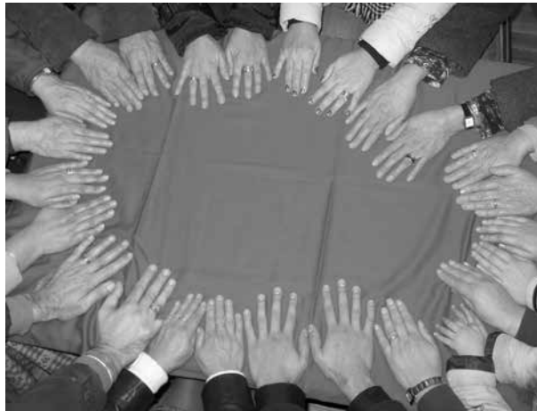
Old Primary School, S. Jorge de Selho, Pevidém, used by the group Rastilho, December 2012.