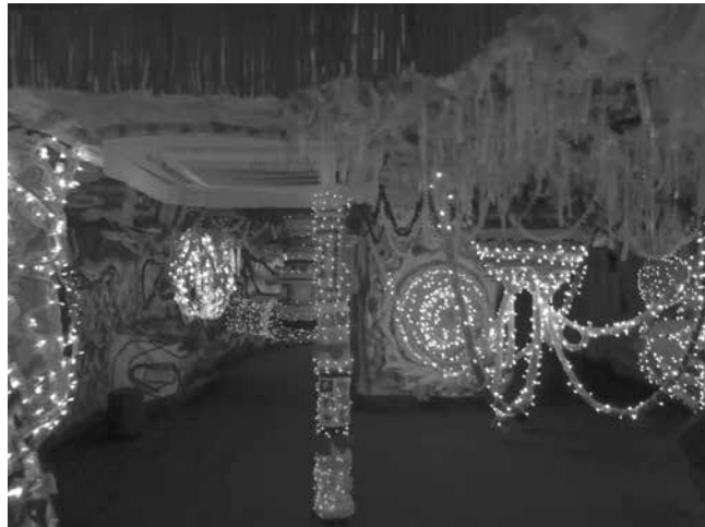
Joana Vasconcelos View inside Trafaria Praia (2013) Portuguese Pavilion, Venice Biennale (2013)

roaming the Venetian channels, but also a window for Portuguese products and crafts such as the traditional blue and white ceramic tiles that covered the boat, or the cork used inside, and the pavilion included a store with traditional Portuguese products on sale. The artistic project presented inside the floating pavilion consisted of an installation, or “environment” (as designated in the official website 2 ), made of textiles and blue light, reminiscent of other textile works by Vasconcelos such as the Valkyries (2004-ongoing). Memory and its relation with identity was then identified as one of Vasconcelos’ main approaches to art because of the way that the artist had recuperated Portuguese traditions and traditional ways of making with a post-modern twist. This was visible in other earlier works, such as Coração Independente Vermelho (2005) quoting Portuguese filigree, or Donzela (2007) a piece built with handmade