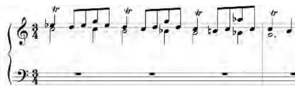
1. Carlos Seixas, Sonata in C Major, No. 5 1 , mm. 6-9.