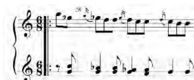
2. Domenico Scarlatti, Sonata in C Major, K. 159, mm. 25-7.

No doubt, many of these Phrygian elements can be discovered in many of Scarlatti’s sonatas, and he undeniably reinforced the use of this idiomatic characteristic in his years in Spain, particularly in Seville, with all the richness and exoticism of the Andalusian atmosphere. But definitely, the prior years spent in Lisbon, together with his contact with the Portuguese folk traditions, notably the Fado, a typically Lisbon song, must have certainly had a decisive influence on the Italian composer. As Seixas reportedly never left his native country, and the individuality of his language is widely recognized as portraying a Portuguese identity (see fig. 3 on page 10), and if the Phrygian elements are a consistent part of his idiom, I consider it only fair to acknowledge the decisive influence of the Portuguese period on Scarlatti and refer to the reported Phrygian flavors as Iberian rather than merely Spanish.