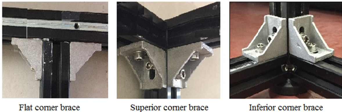
Figure 2. Structure braces.

Furthermore, the structure has a metal bar, close to the floor, including the entrance, requiring the children to pass over it to be scanned. In many occasions, even though being warned, the children stepped on it, unbalancing the structure and requiring the devices' recalibration.