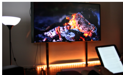
Fig. 2. Technical infrastructure of the prototyping environment

Presently, the STREEN prototyping tool is a mobile application that is able to control a technical infrastructure composed by speakers, a smart TV, a Philips Hue LED bulb and a Philips Hue LED strip (see Fig. 2). The tool displays a set of buttons that interact with specific parts of the narrative, this way allowing the designer to trigger synchronized digital media enrichments.