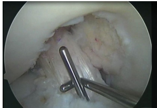
Fig. 2 The arthroscopic photo shows the final graft position during fixation at tibia. After the fixation to the femur, the graft was externally rotated 90° around its long axis, to replicate the natural rotation of the native ACL. At about 20–30° of flexion, maximal tension is applied manually, by pulling the graft from its patellar bone plug while centering the tibia by pushing it in posterior drawer position to correct the ATT and by rotating it externally to correct the internal rotation. To correct the tibiofemoral subluxation, the lower limb was retained at about the same position as the contralateral limb to adjust for the appropriate amount of external rotation. Holding the knee at this position and with the graft tensioned as described, we proceeded to the fixation on the tibia with the appropriately sized interference screw

the natural rotation of the native ACL. At about 20–30° of flexion maximal tension was applied manually, by pulling the graft from its patellar bone plug while centering the tibia by pushing it in posterior drawer position to correct the ATT and by rotating it externally to correct the internal rotation (Figs. 2, 3). To correct the tibiofemoral subluxation, the lower limb was retained at about the same position as the contralateral limb to adjust for the appropriate