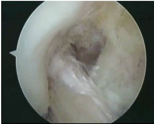
Fig. 3 Checking for impingement. The graft is placed anatomically at femur without impingement to the intercondylar roof or PCL in full extension or flexion. In addition, the graft is positioned more medially at the tibia avoiding impingement to the lateral femoral condyle and the PCL in full extension or flexion. One can see the triangular window between the femoral insertion of the graft and the femoral insertion of the PCL and also the appropriate distance between the distal part of the graft and the femoral condyle

amount of external rotation. The same rehabilitation protocol was used postoperatively for all patients.