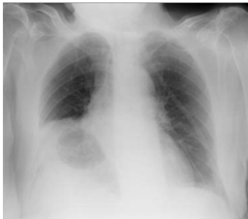
Figure 1 Chest X-ray.

An 89-year-old woman presented to the emergency department with cough for the past couple of days. Chest X-ray revealed an area of condensation at the inferior lobe of the right lung, suggestive of pneumonia (figure 1). This image was similar to another X-ray that had been taken the year before.