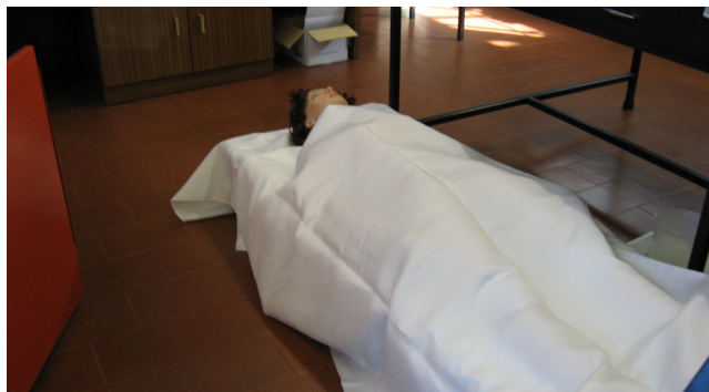
FIGURE 1. Thermal manikin measurements with the selected finished bed linens C and E

Therefore, thermal insulation of these formulations was evaluated through thermal manikin measurements. The goal was to maintain the skin temperature at 33 °C. (Figure 1).