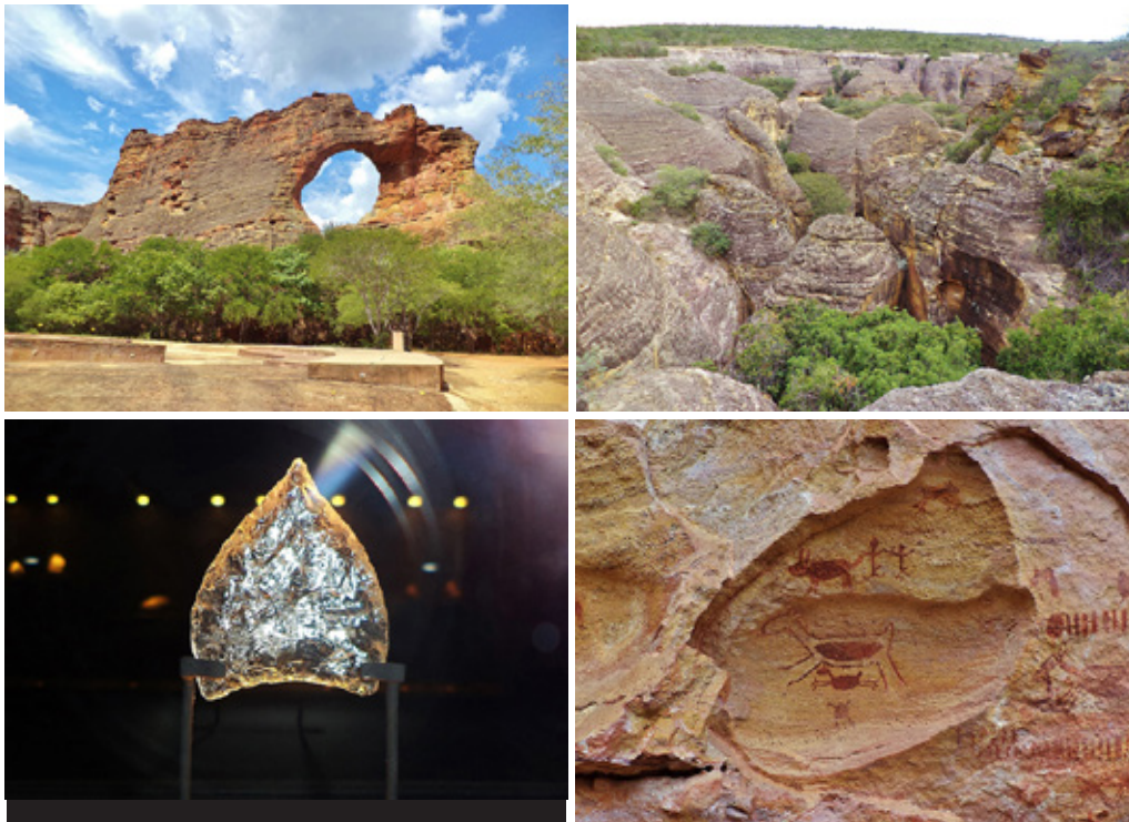
Figure 1. Examples of geodiversity and archaeology in Serra da Capivara National Park. Above, "Pedra Furada" (left) and "Baixão das Andorinhas" (right). Below, fishtail-shaped quartz arrowhead (approximately 4 cm wide and 8,000 years old) and the rock paintings that have become the symbol of the park.

The Foundation and Museum of the American Man (FUMDHAM - non-profit organization established in 1986), in partnership with the Ministries of the Environment and Culture, are in charge of the management of the museum and the heritage preservation. The management plan contains policies on social inclusion and environmental protection actions, along with projects on education and professional training for the community and the development of sustainable tourism. The park was included in the UNESCO World Heritage List in 1991, because it preserves about 1223 archaeological and palaeontological sites with rupestrian paintings and carvings and 292 sites registered as villages, cemeteries, temporary camps and lithic and ceramics workshops (Fig.1).