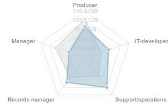
Figure 3. Example comparison of budget spent in different labour roles between two organizations.

The web application also allows peer-to-peer comparison between organizations with similar characteristics, to find out discrepancies. Figure 3 shows an example comparison of the costs mapped into labour roles between two organizations. This comparison is only possible if at least one of the organizations allows peer-to-peer comparison, although it can maintain anonymity.