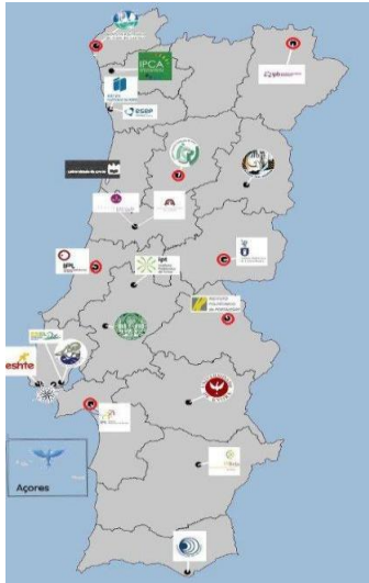
Figure 1 – Portuguese Polytechnic Institutes location.

their mission the promotion of regional development and a close relation with local organizations, applying more practical learning methodologies.