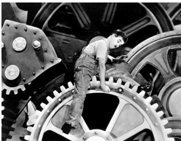
Fig. 1. Scene of Charlie Chaplin's film “Modern Times”

As a consequence of the Techno-Centric System, operators are isolated and do not share experiences and knowledge. The promotion of operators is compromised because they are denied the opportunity to learn in order to perform other tasks. Consequently, stress and aggressive and/or angry behaviours are prone to occur. This disequilibrium provokes musculoskeletal lesions, work dissatisfaction and absenteeism. The famous Charlie Chaplin's movie "Modern Times" (1936) is a clear critic to the hard conditions on the factories at that time, which led to countless manifestations and strikes (Fig. 1.).