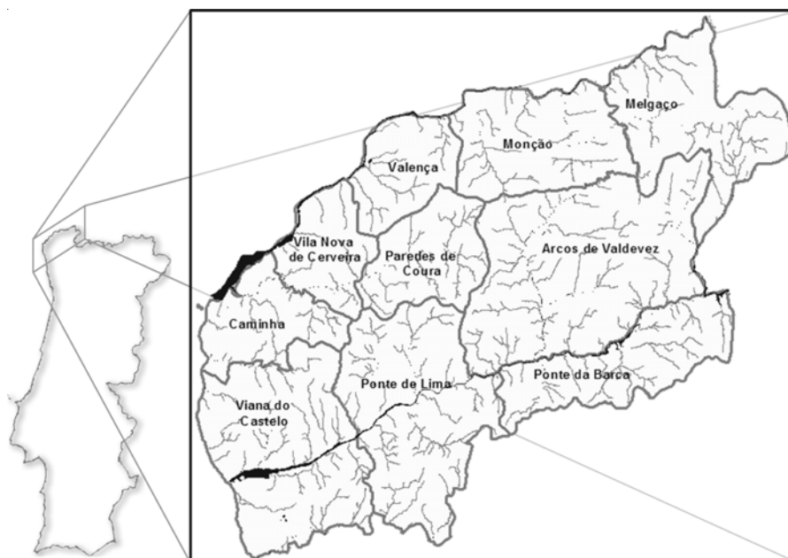
Fig. 1. Minho–Lima river basin study area (Portugal).