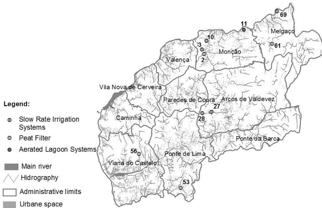
Fig. 3. Potential locations for decentralized low-energy wastewater treatment plants.

low-energy wastewater treatment plants was then set using a cross-comparison between land characteristics and economic criteria. The results are shown in Fig. 3.